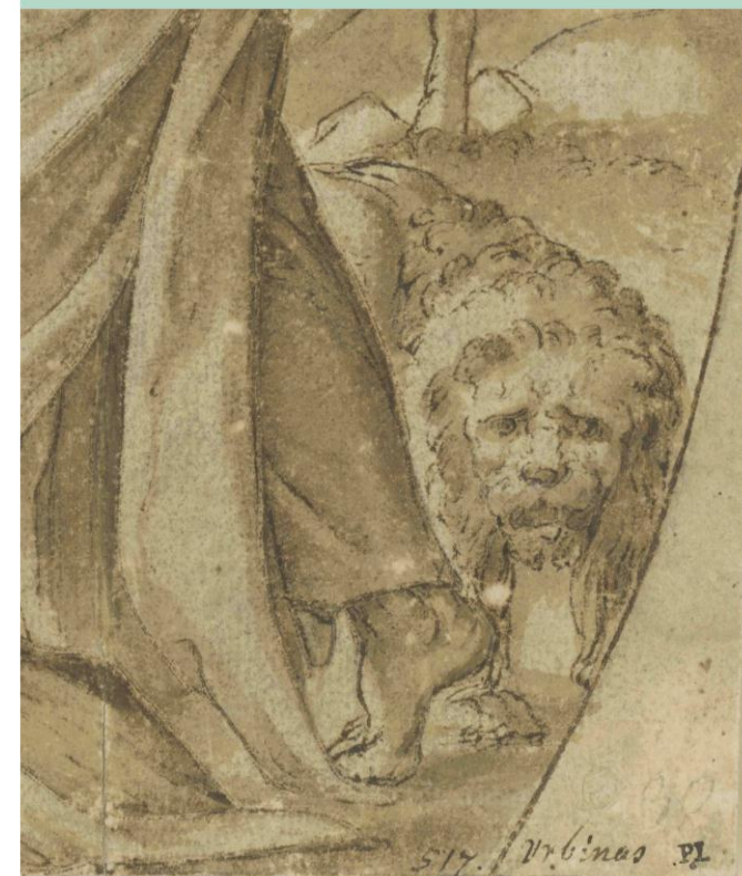
Cover image: Giulio Romano, St. Peter with Two Saints, after 1525, detail with collectors' notes and marks.

Excursions to Staatliche Graphische Sammlung München on 13 June and to Burg Trausnitz, Landshut on 16 June